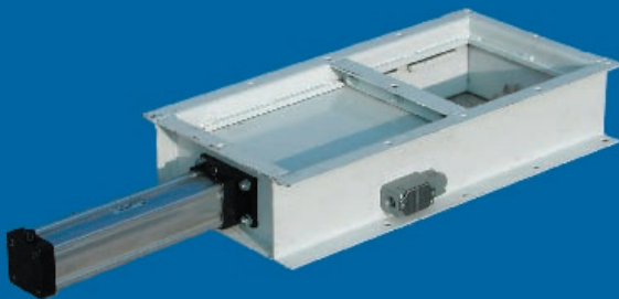
Air Slide Gates