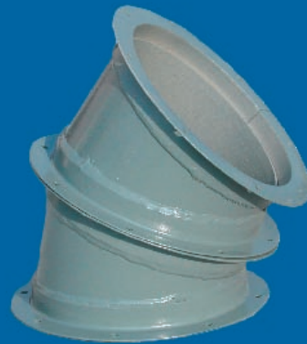
Heavy Gauge Adjustable Elbows