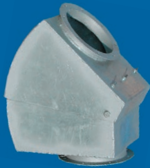
Rubber Lined Cushion Boxes