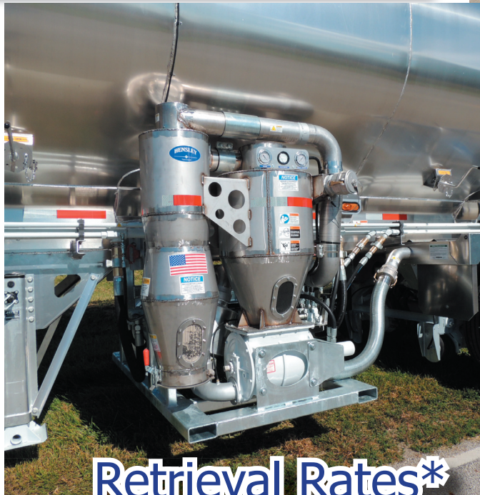
LEFT-UNDER BELLY MOUNT WITH FORKLIFT POCKETS AND QUICK DISCONNECTS FOR QUICK AND EASY REMOVAL