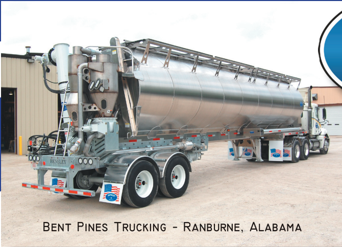
BENT PINES TRUCKING - RANBURN, ALABAMA