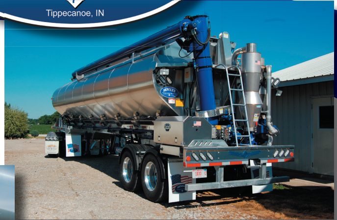
ABOVE-REAR MOUNT SYSTEM WITH BLOWER ON TRAILER