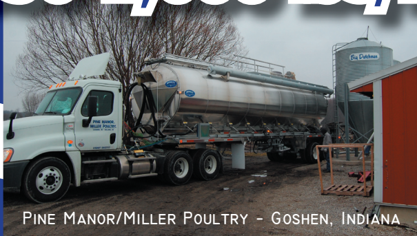
PINE MANOR/MILLER POULTRY - GOSHEN, INDIANA